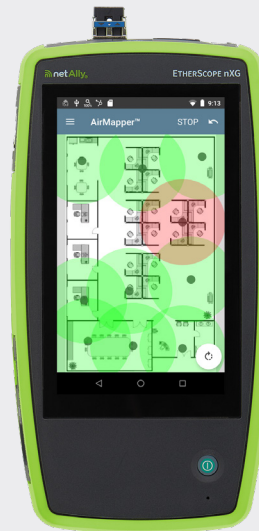
EtherScope nXG Portable Network Expert

See back page for full product comparison.