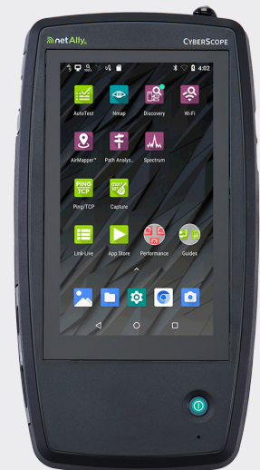
CyberScope Handheld Cybersecurity Analyzer

Contact your authorized NetAlly reseller directly or email us at sales@netally.com